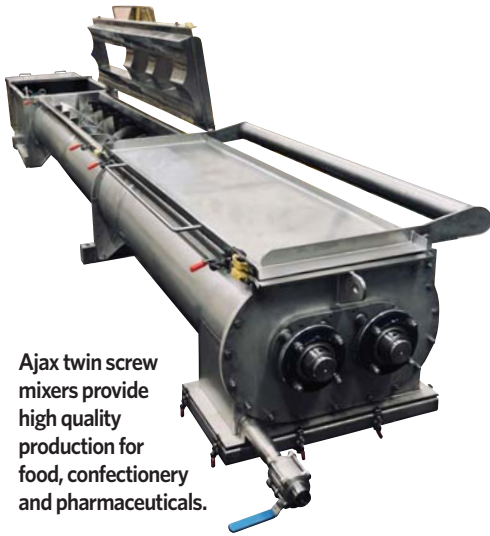
Ajax twin screw mixers provide high quality production for food, confectionery and pharmaceuticals.

50 years ago Ajax Equipment was formed to provide effective and efficient solids handling systems that make a difference to businesses. Today that same ambition is powering Ajax to meet the needs of a specialised and global marketplace. Advances in engineering combined with insights into materials performance enable Ajax to develop world leading solids handling equipment across varied industries.