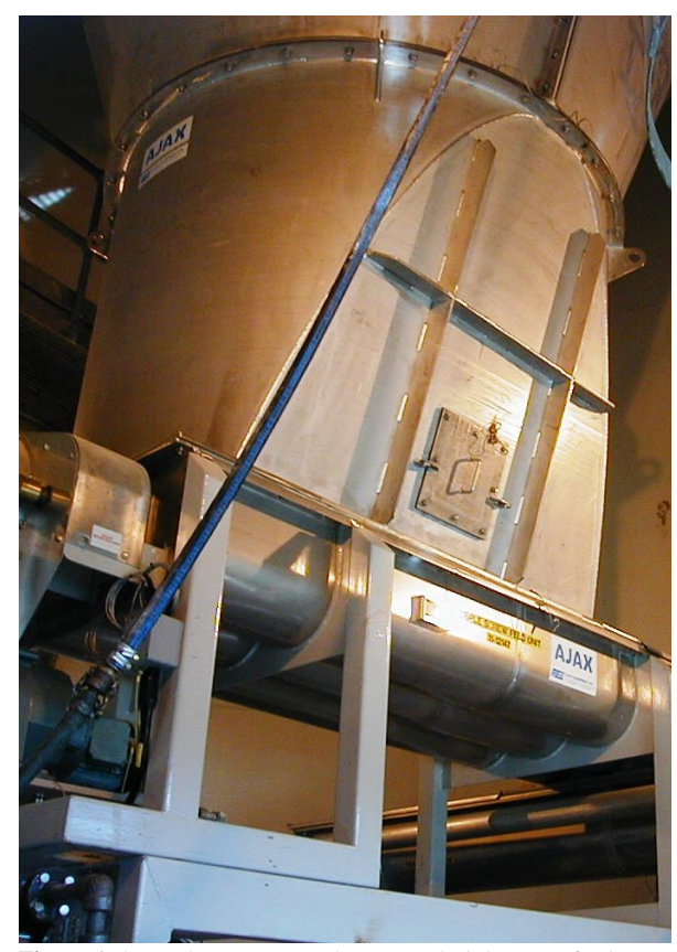
Figure 1 shows the new AJAX hopper and triple screw feeder.

Shear strength tests results indicated the potential for the product to form stable rat holes approaching 3m diameter so it was clear that the existing cone would have to be converted. Tests to examine the merits of stainless steel 2B finish as a contact surface for slip showed that stainless steel 2B offers significant slip advantages over aluminium.